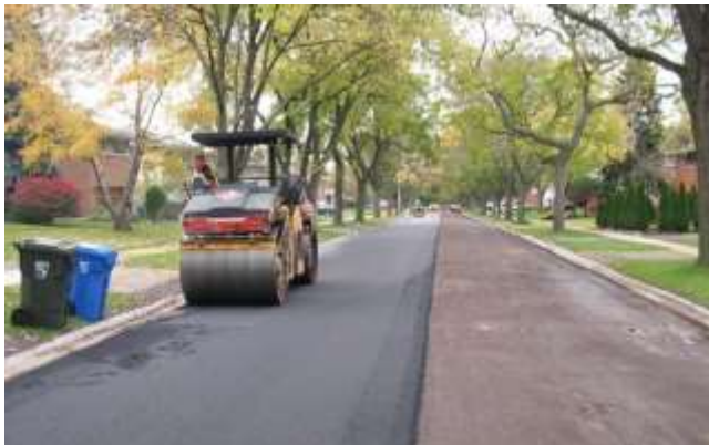
Vibratory roller compacting the first layer of asphalt.