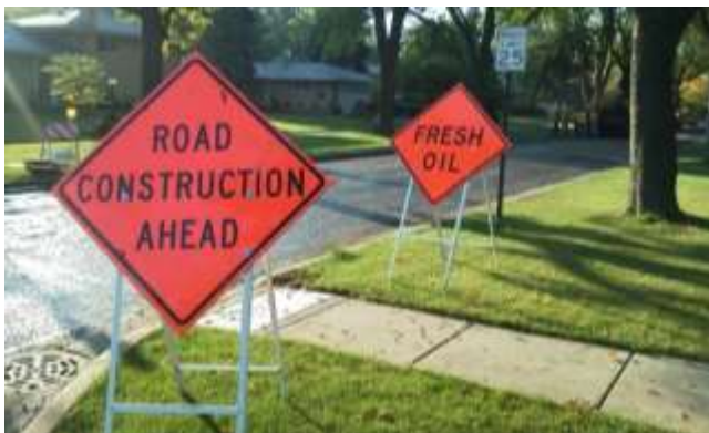
Pay attention to traffic control devices and drive slow.