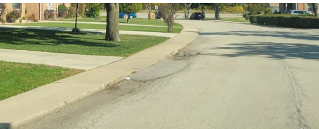
Example of an existing section.

New England Ave - Oakton St to North End Keeney St - Waukegan Rd to Caldwell Ave Newland Ave - Cleveland St to Madison St Newcastle Ave - Cleveland St to Madison St Madison St - Waukegan Rd to Caldwell Ave