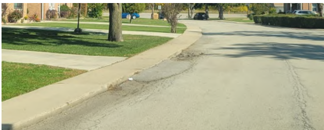
Example of an existing section.

Oriole Ave – Howard St to Oakton St (Niles and Park Ridge Collaboration)