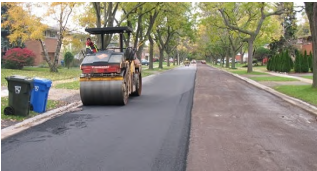
Vibratory roller compacting the first asphalt layer.