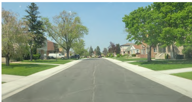
Example of a similar recently completed street.