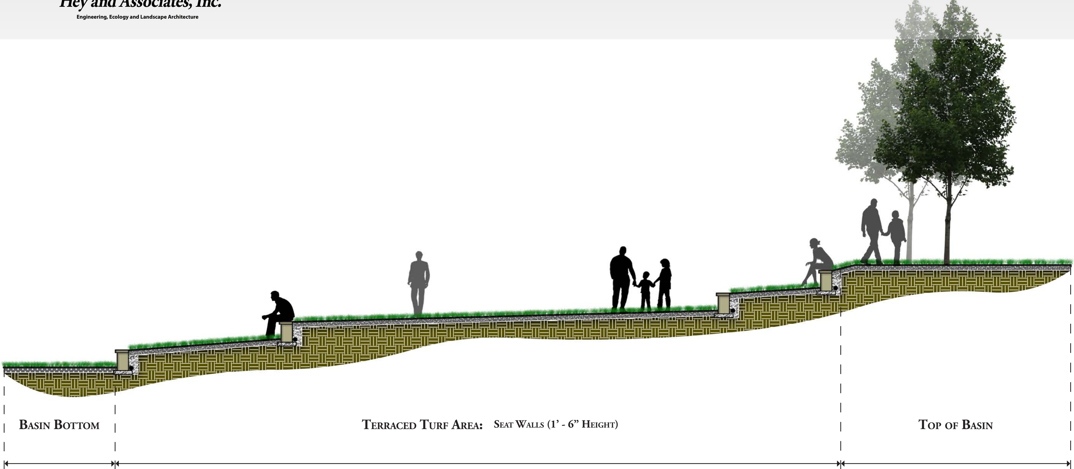
SECTION (A) VIEWING NORTH

PREPARED BY: Hey and Associates, Inc. Engineering, Ecology and Landscape Architecture